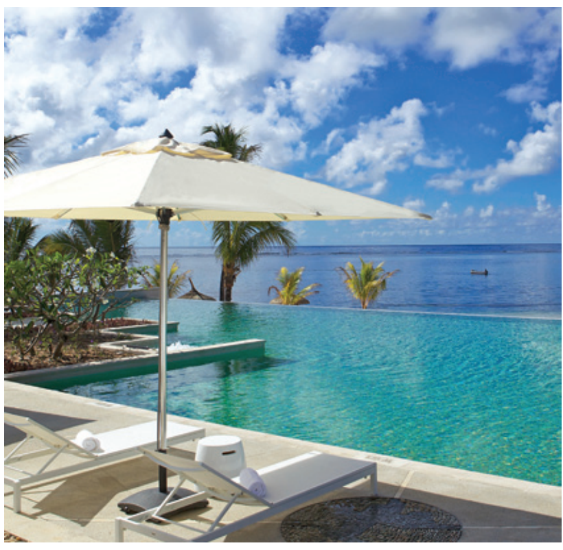
Life between beach and pool

WATER SPORTS (with additional fee) Scuba diving, (PADI open-water courses available) Big game fishing, Parasailing, Catamaran sailing, Canoeing, Banana ride, Waterskiing, Kite Surfing, undersea walk, paddle.