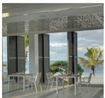
Long Beach, the most contemporary hotel in Mauritius