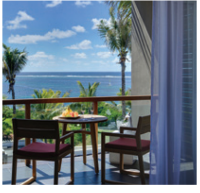
Long Beach embodies a new farniente spirit