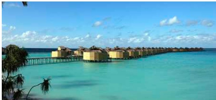
Six Senses Laamu

Six Senses Laamu sits on the Laamu Atoll to the south of the Maldives archipelago. From Male' International Airport, it is just a fifty minute flight, along the beautiful Maldivian coastline to Kadhdhoo. A short twenty five minute boat trip later and guests have arrived at the powder white sand and crystal clear turquoise water paradise which is Six Senses Laamu.