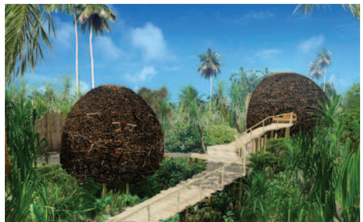
Six Senses Spa