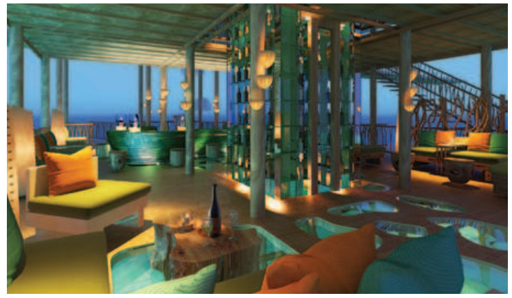
Chill Lounge & Bar

- Library offering access to the internet along with a comprehensive reading list and the latest in music and movies - to watch and listen anywhere, anytime on handheld individual units