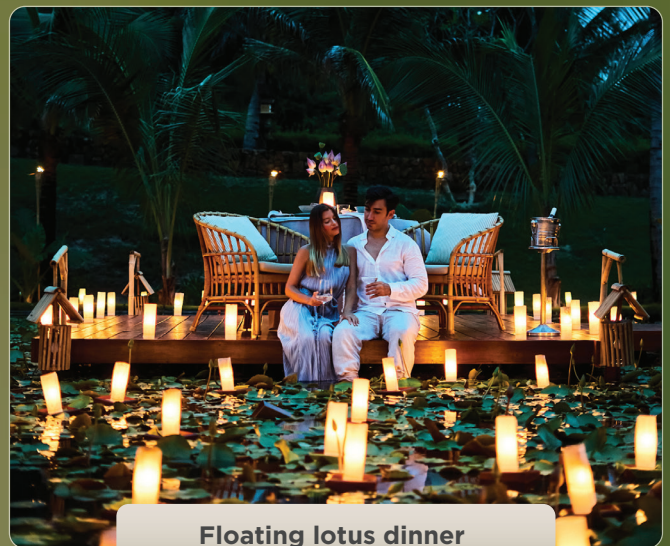
Floating lotus dinner