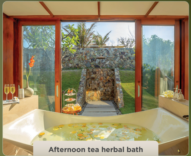
Afternoon tea herbal bath