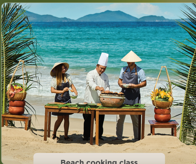
Beach cooking class