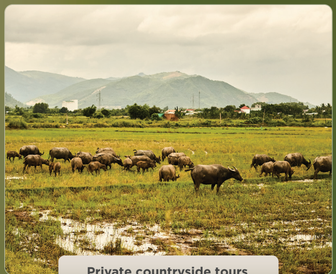
Private countryside tours