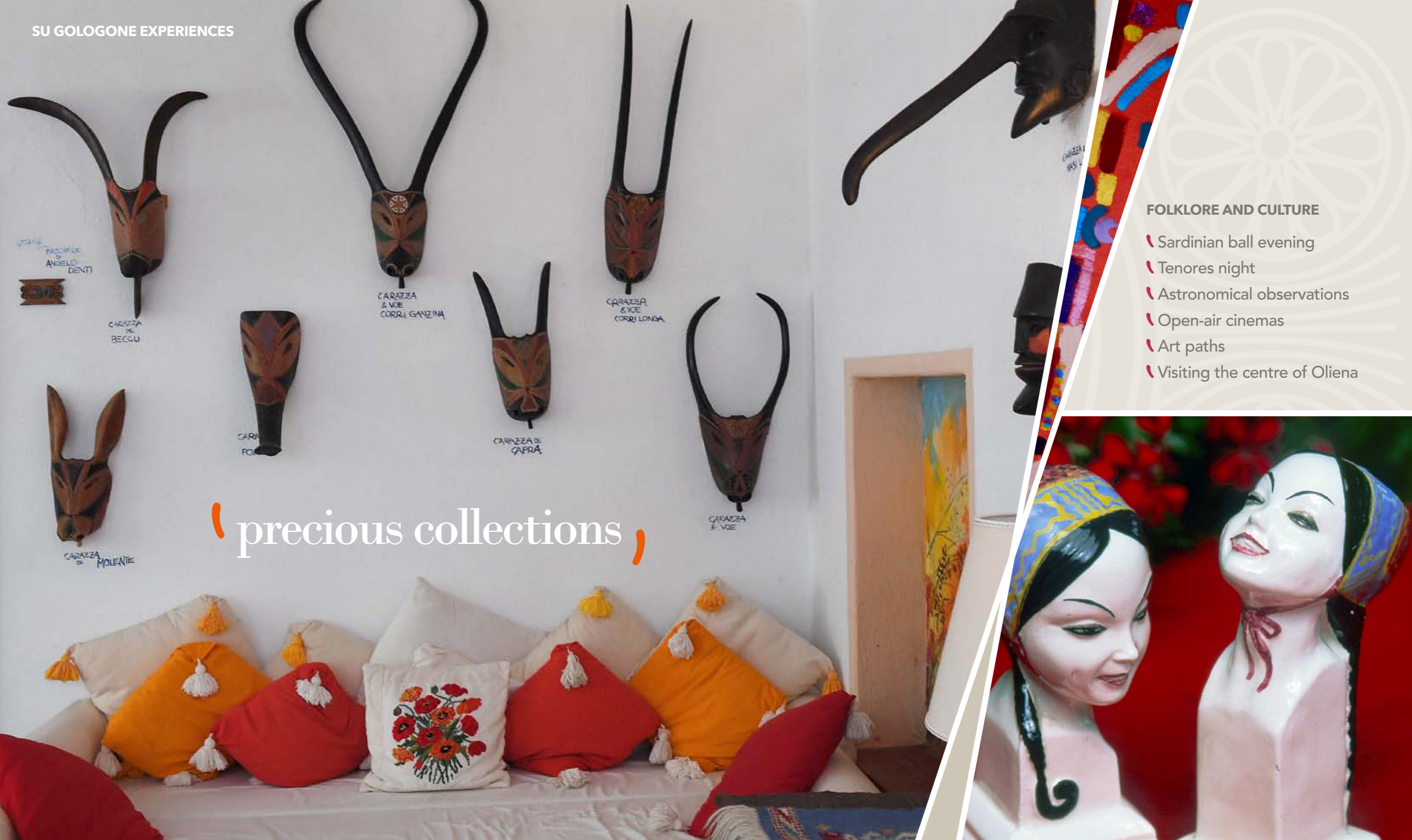
PASCHERE DI ANGELO DENTI