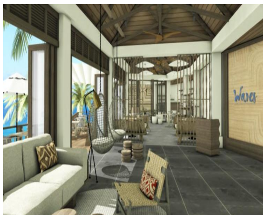
New Look and Feel – Waves