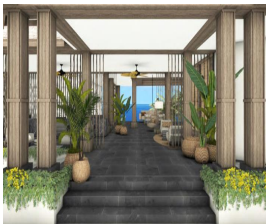
New Look and Feel – Lobby