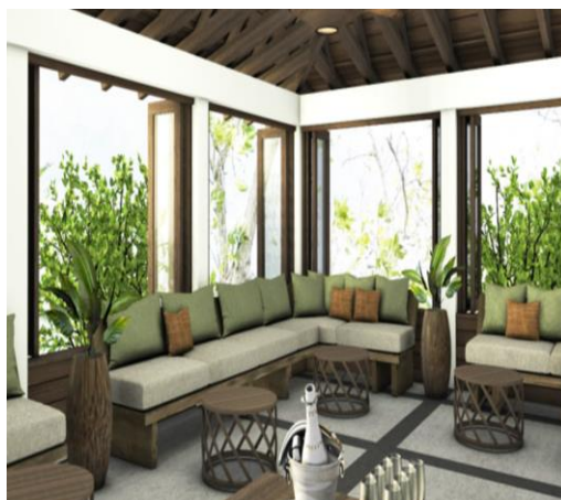
New Look and Feel – Arrival Pavilion