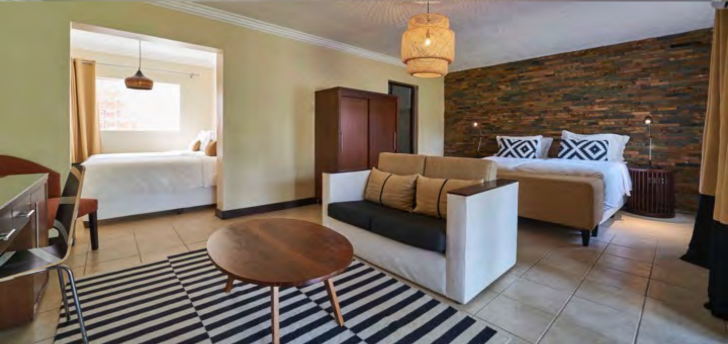
Omali Family Room