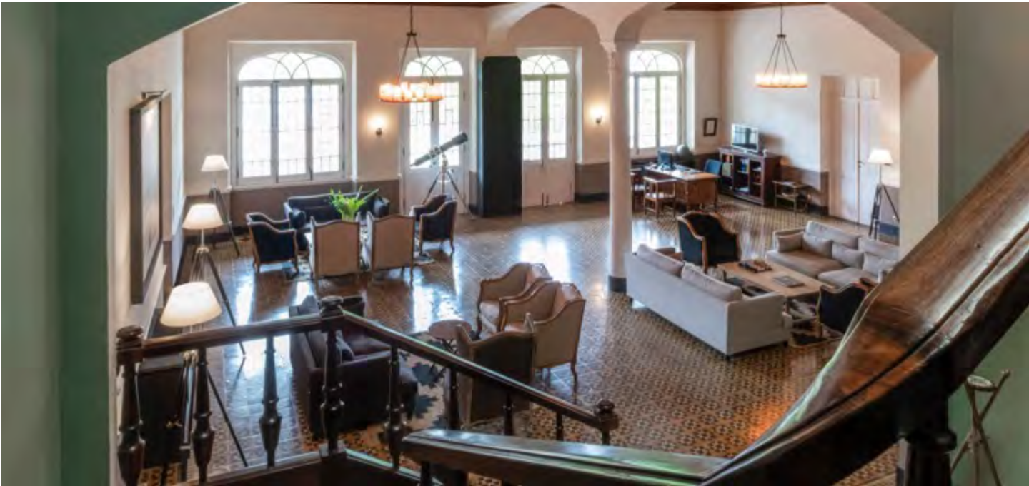
Roça Sundy Eclipse Lounge