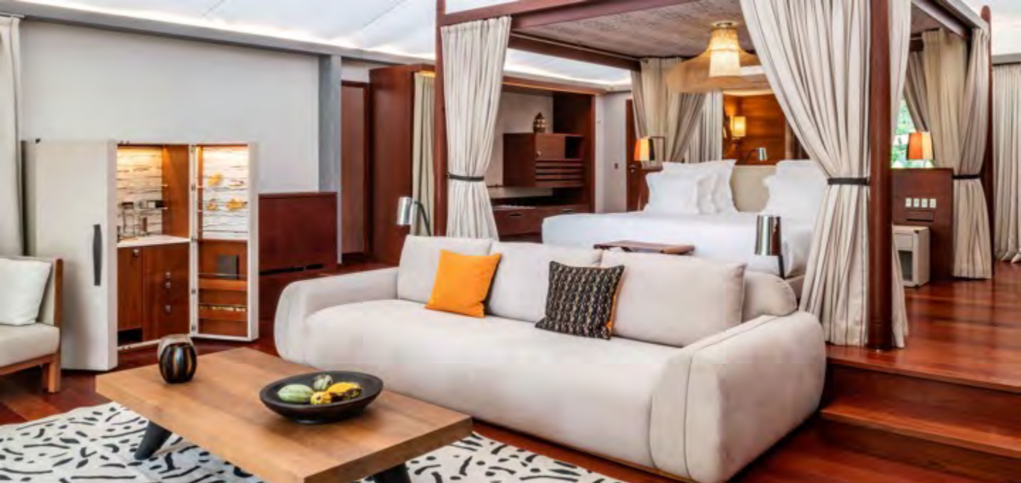
1 Bedroom Tented Villa