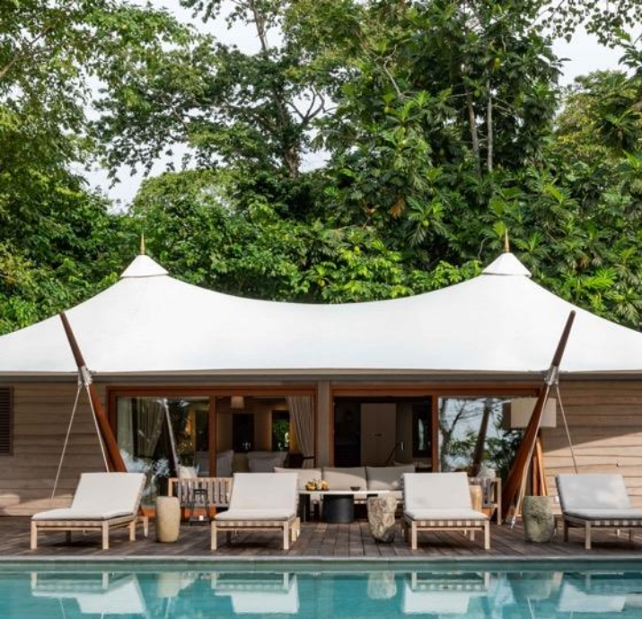
3-Bedroom Tented Villa