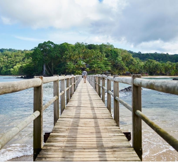
Bridge to Bom Bom islet