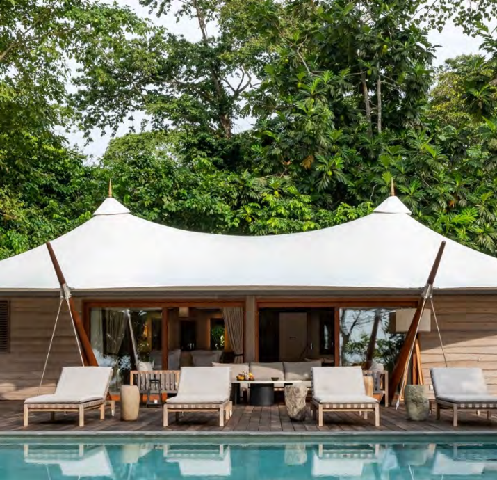
1 Bedroom Tented Villa