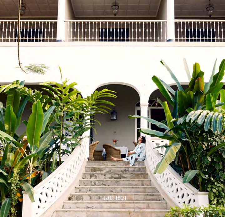
Roça Sundry Eclipse House