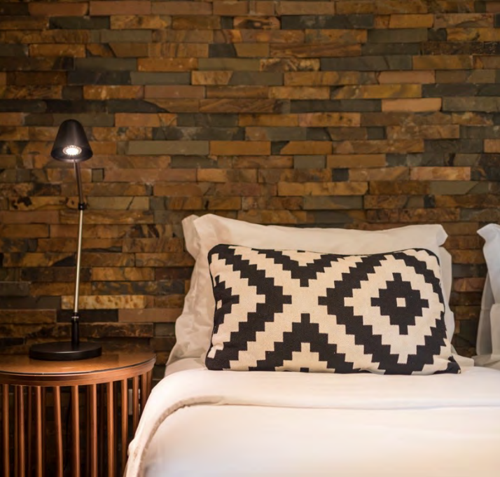
Omali Bedroom Details