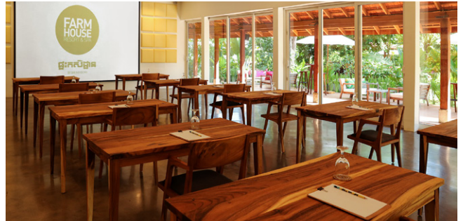
Board Room (AC), up to 40 pax