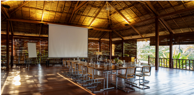
Meeting Shala (open air), up to 80 pax