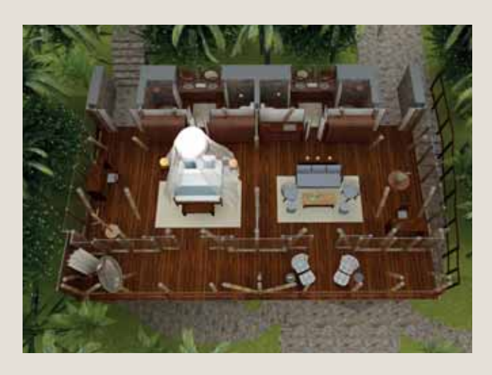
*An additional bed can be set up on request