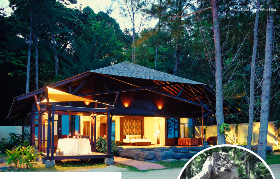
Borneo Eagle Resort's Pool Villa