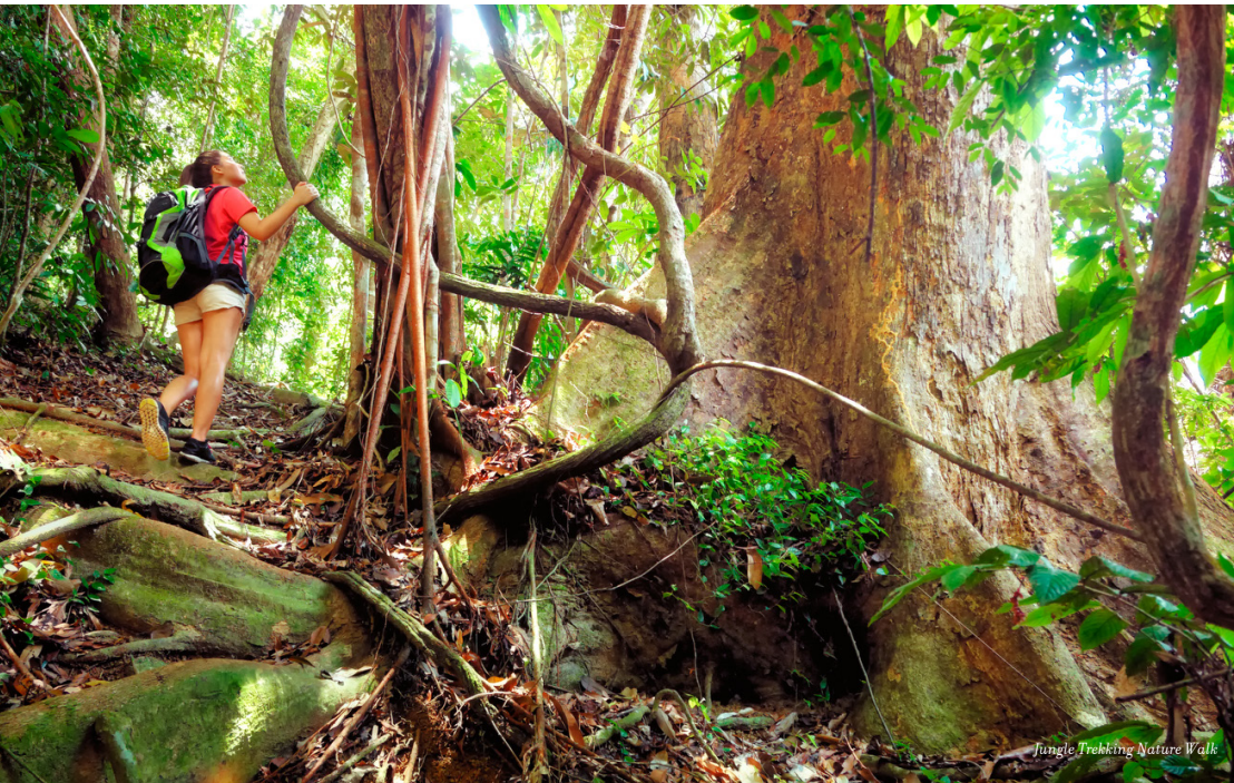
Jungle Trekking Nature Walk

"Travel is not reward for working, it's education for living."