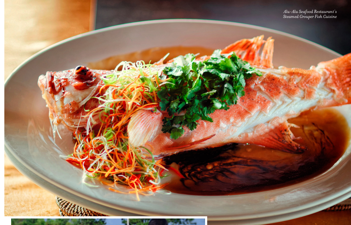
Alu-Alu Seafood Restaurant's Steamed Grouper Fish Cuisine