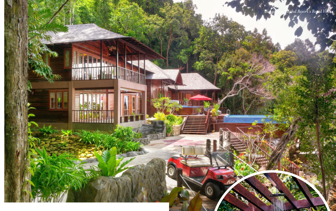
Bungaraya Island Resort's Royal Villa

For guests who don't want to miss a workout while on vacation, the resort has a fitness centre with state-of-the-art cardio equipment, weight machines and functional training elements. Personal training sessions in yoga and Pilates can be arranged upon request.