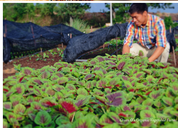
Green O's Organic Vegetable Farm

A walk to discover the trails of Gaya Island uncovers an exciting variety of tropical hardwood trees, herbs animal habitats and forest flowers. Home to hornbills, monkeys, lizards, and curious insects, the Gaya Island forest is set to fascinate nature lovers all year round.