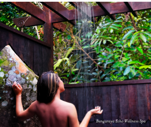
Bungaraya Echo Wellness Spa

We are a travel company Journeys with you into the Heart of Borneo