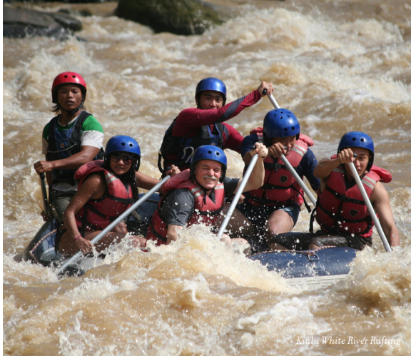
Kaula White River Rafting