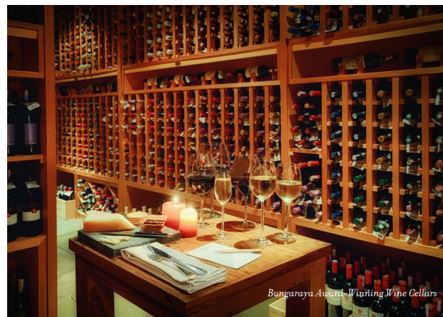
Bungaraya Award-Winning Wine Cellars