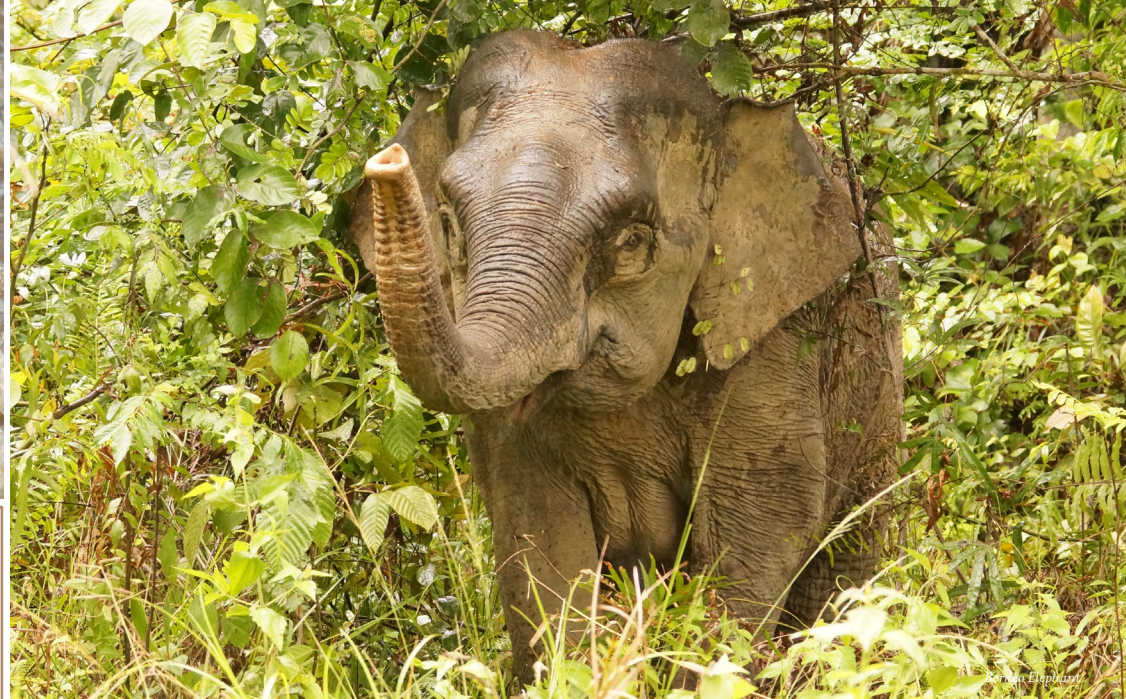
Kuala Lumpur Elephant