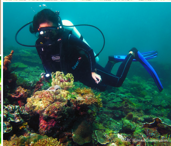
MERC Marine Conservation