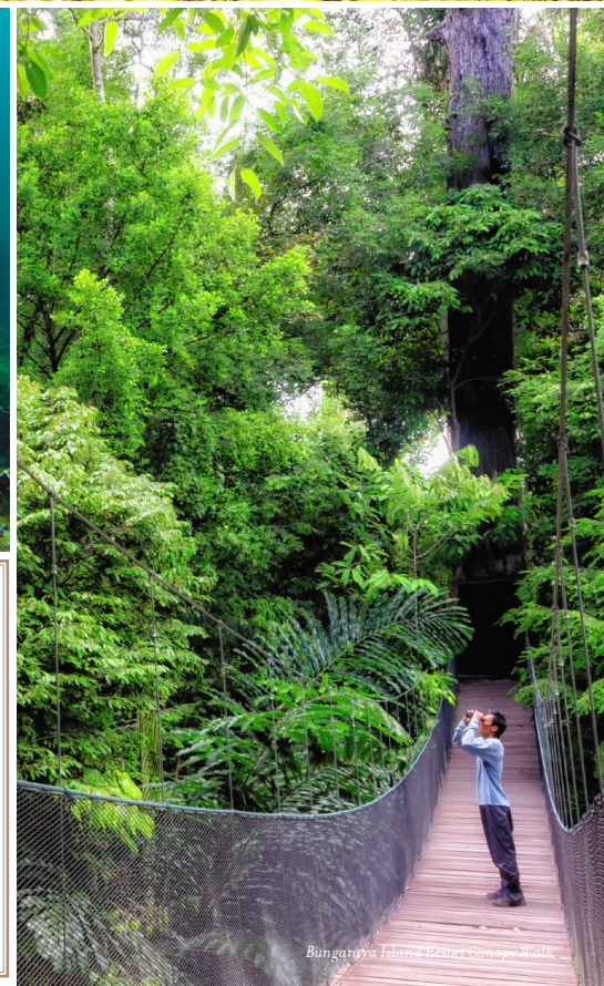
Bungaraya Island Beach Camp Walk