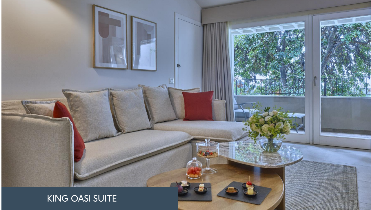
KING OASI SUITE