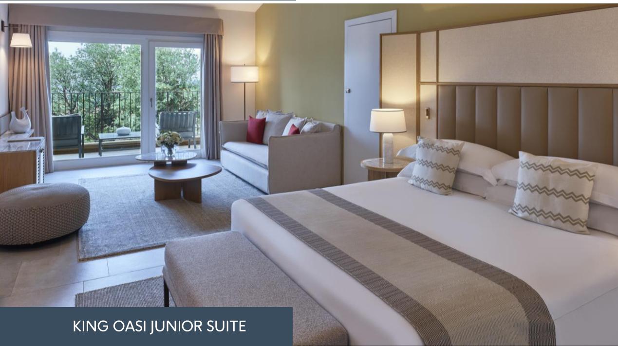
KING OASI JUNIOR SUITE