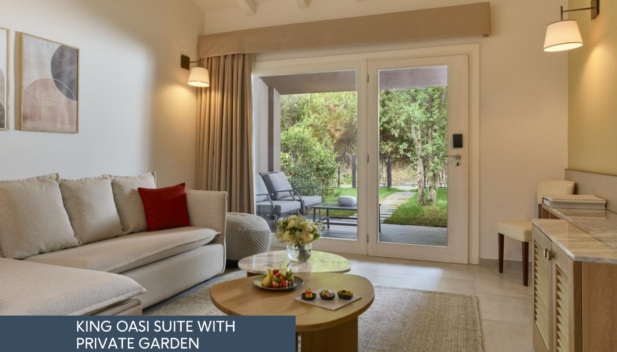
KING OASI SUITE WITH PRIVATE GARDEN