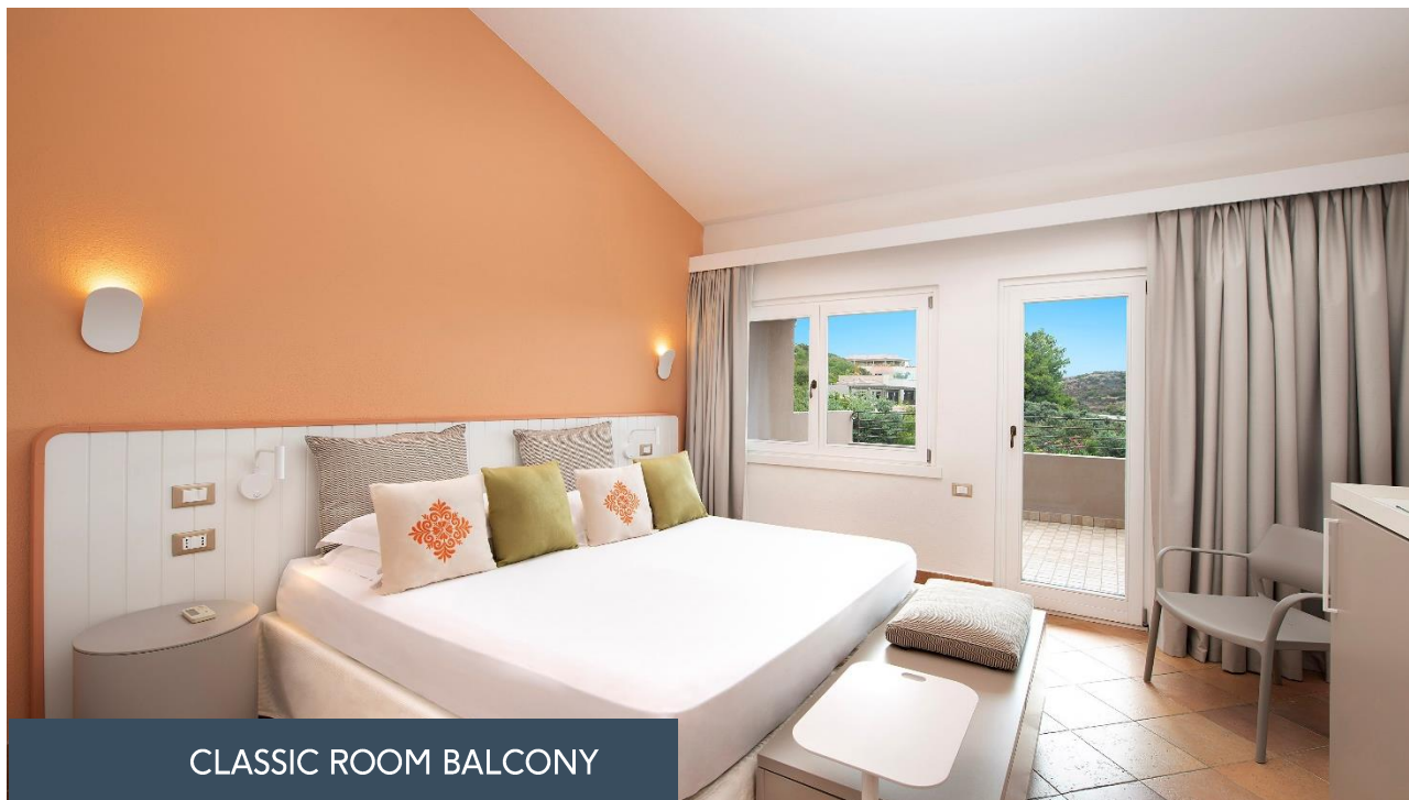
CLASSIC ROOM BALCONY