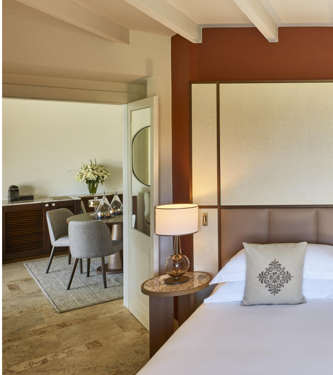
KING DELUXE SUITE WITH SEA VIEW THOLOS