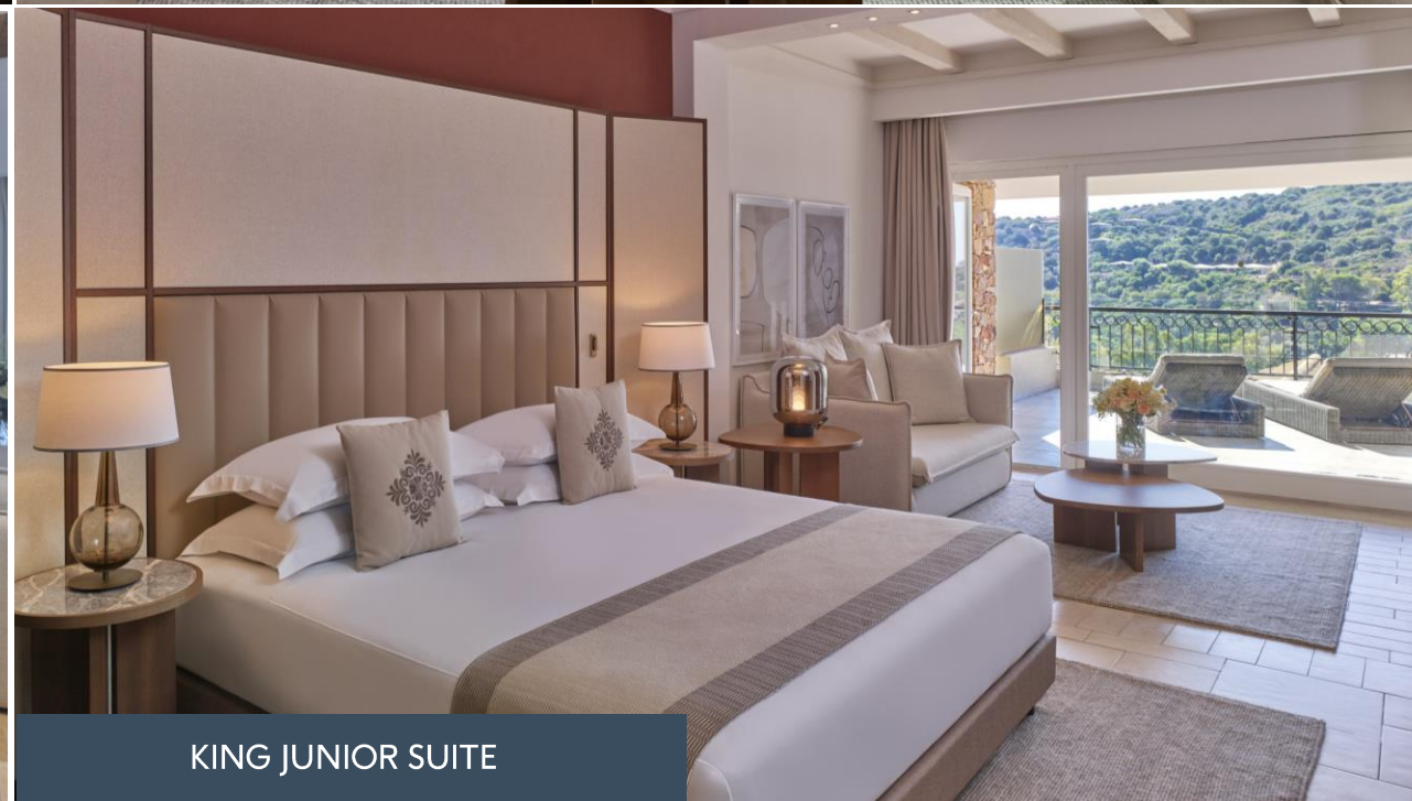
KING JUNIOR SUITE