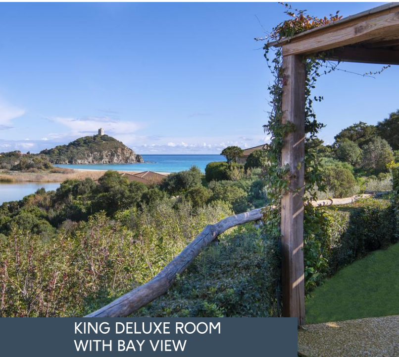
KING DELUXE ROOM WITH BAY VIEW