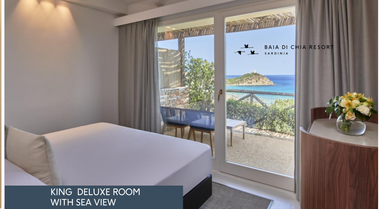
KING DELUXE ROOM WITH SEA VIEW