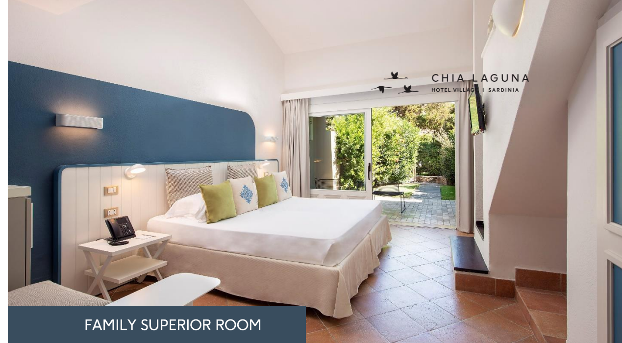
FAMILY SUPERIOR ROOM