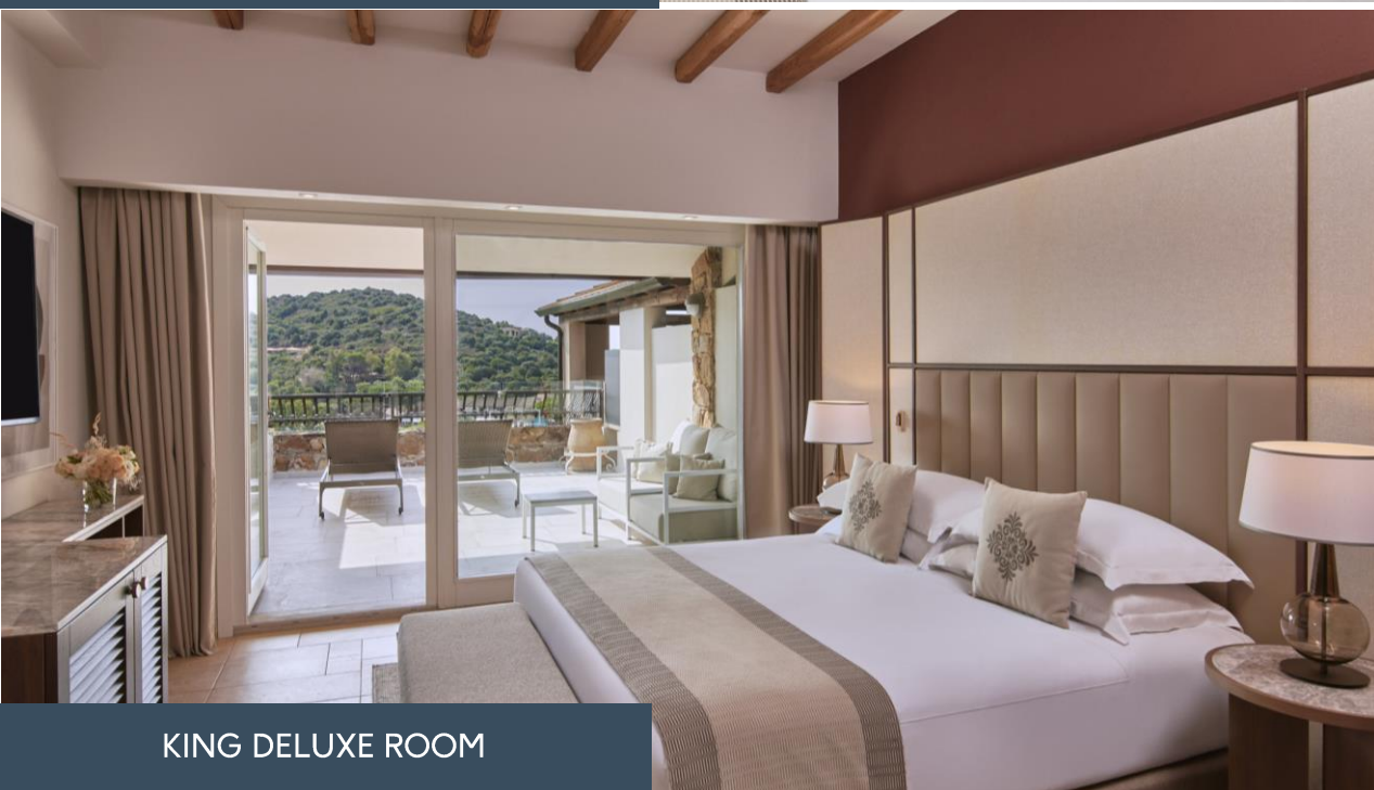
KING DELUXE ROOM