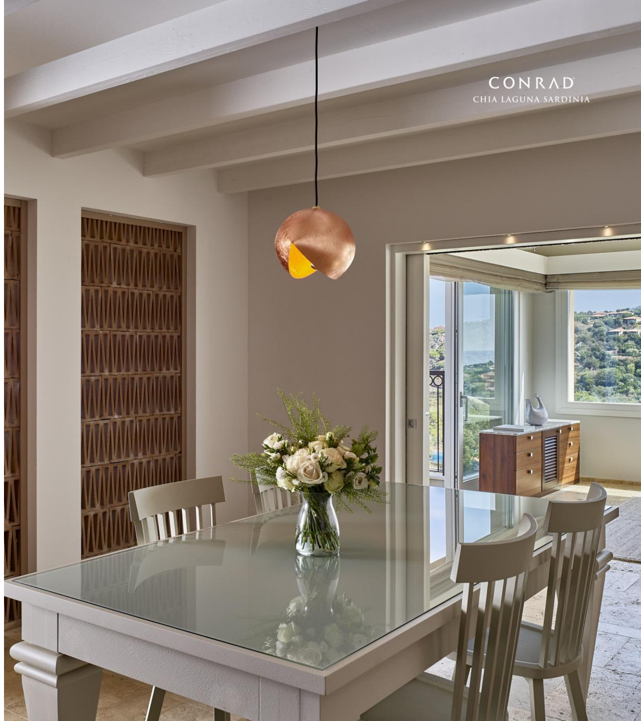
KING PRESIDENTIAL SUITE SEA VIEW SHARDANA