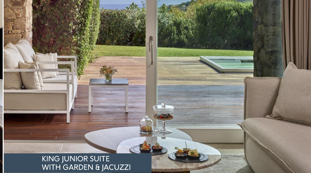
KING JUNIOR SUITE WITH GARDEN & JACUZZI