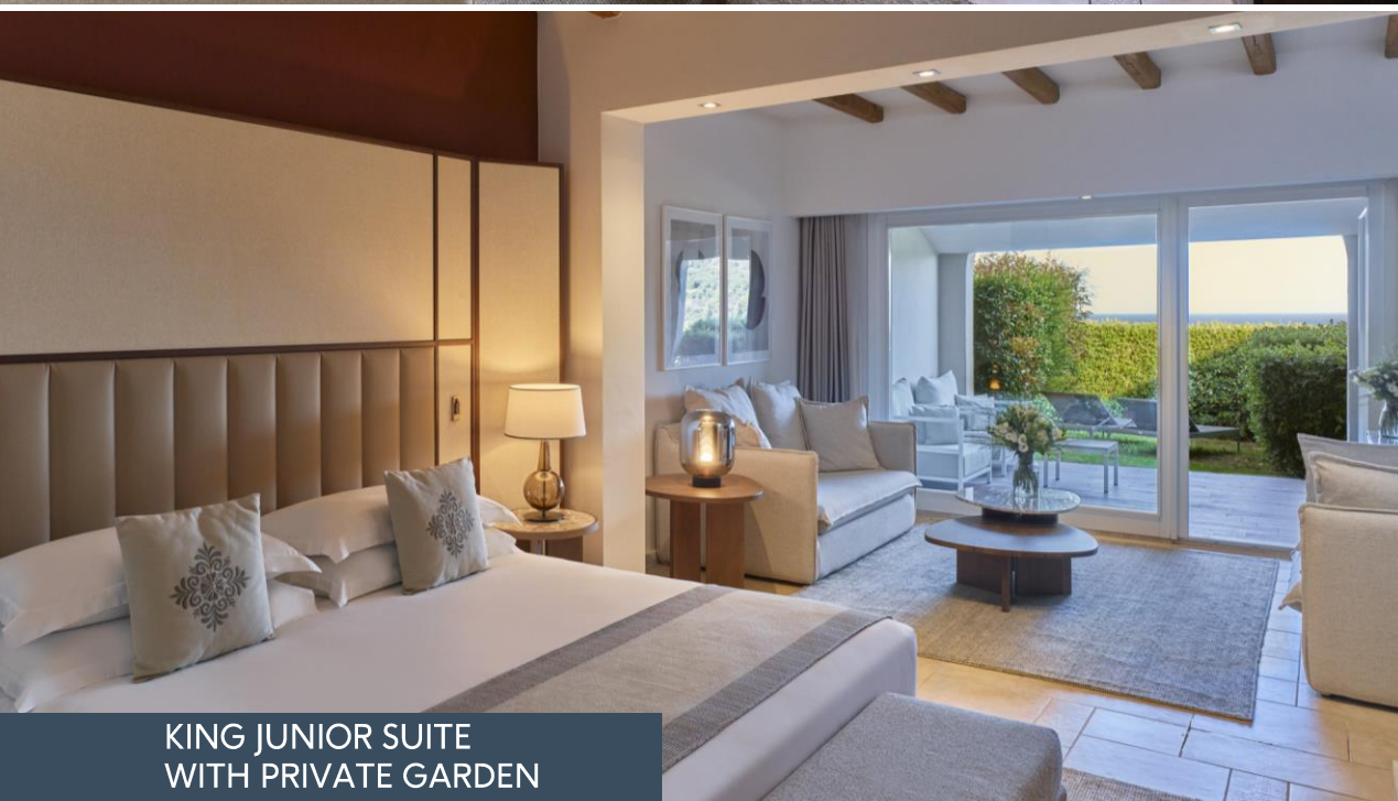
KING JUNIOR SUITE WITH PRIVATE GARDEN