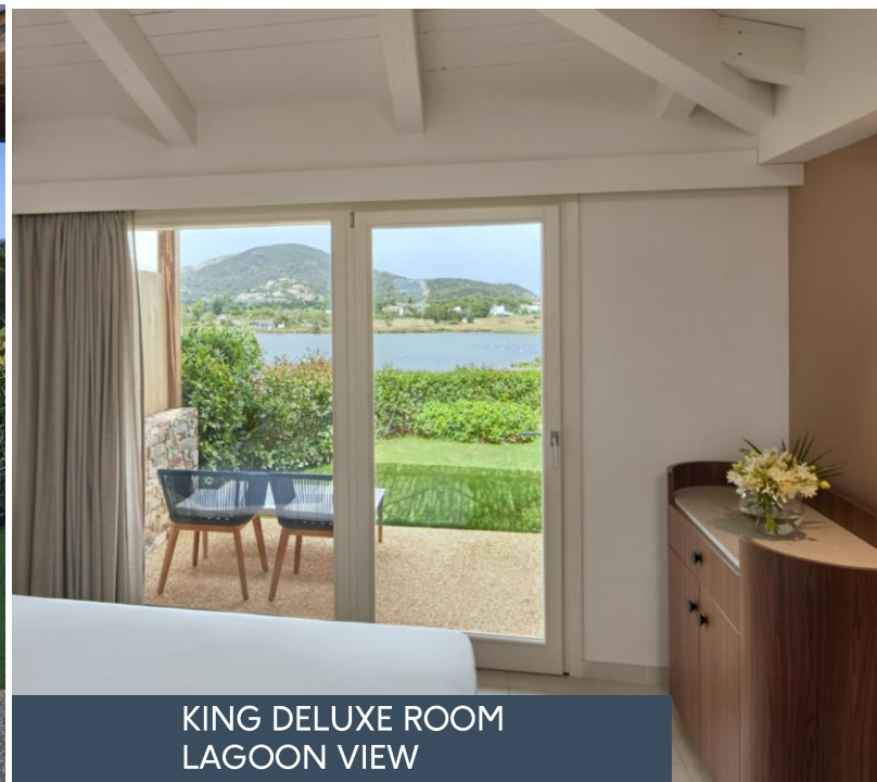
KING DELUXE ROOM LAGOON VIEW