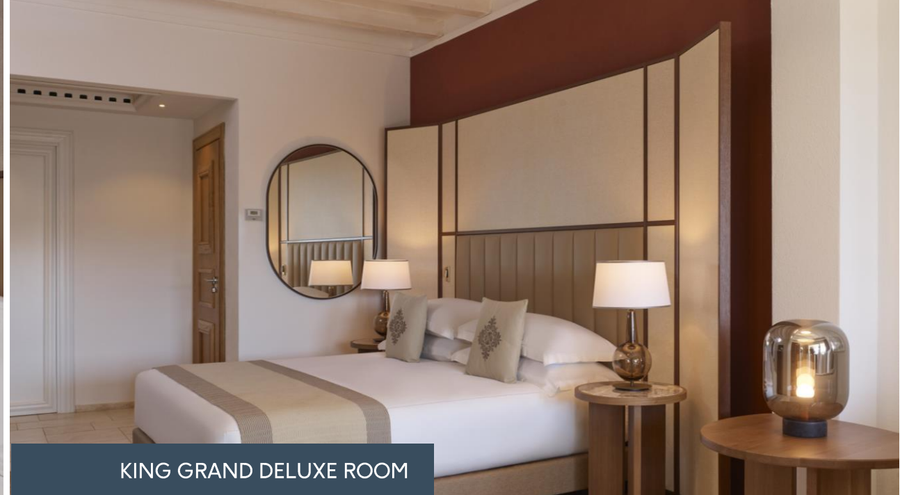
KING GRAND DELUXE ROOM