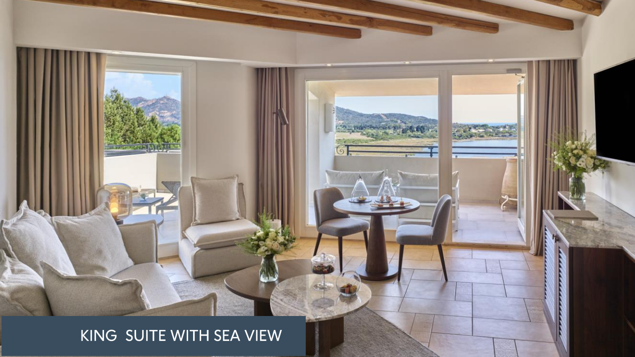
KING SUITE WITH SEA VIEW