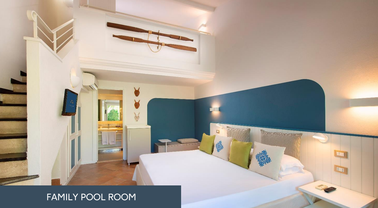
FAMILY POOL ROOM