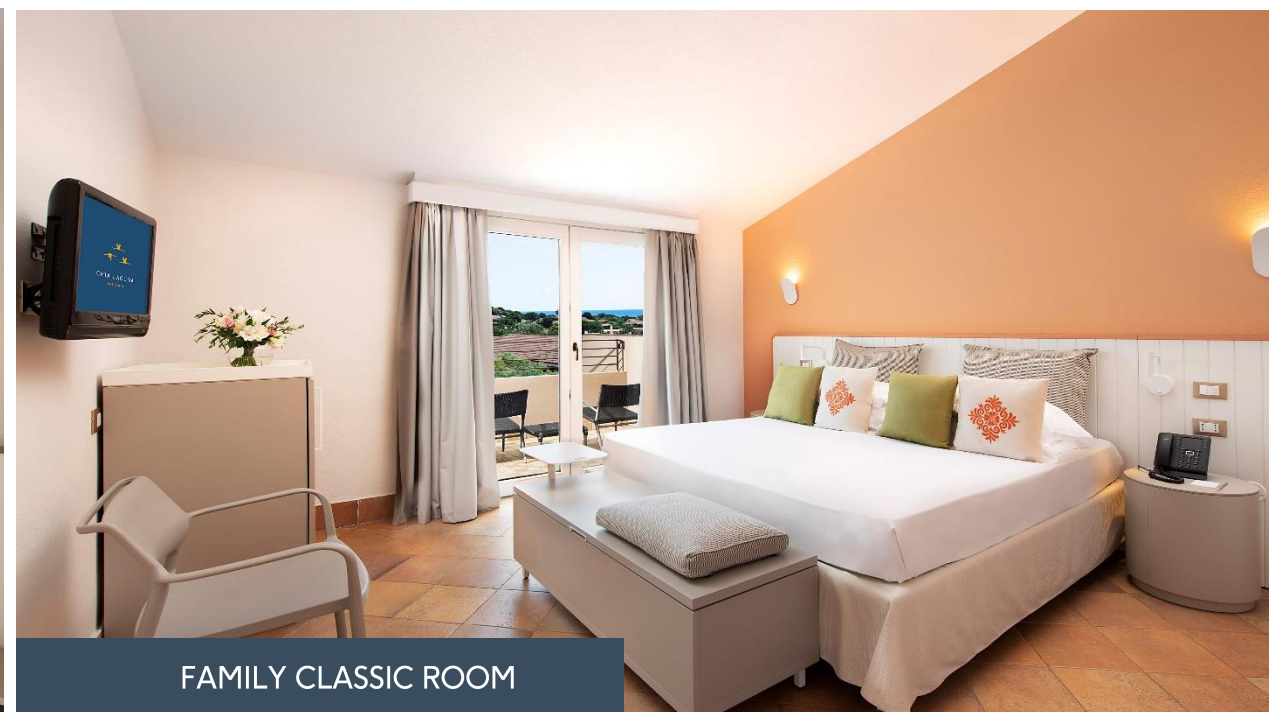
FAMILY CLASSIC ROOM