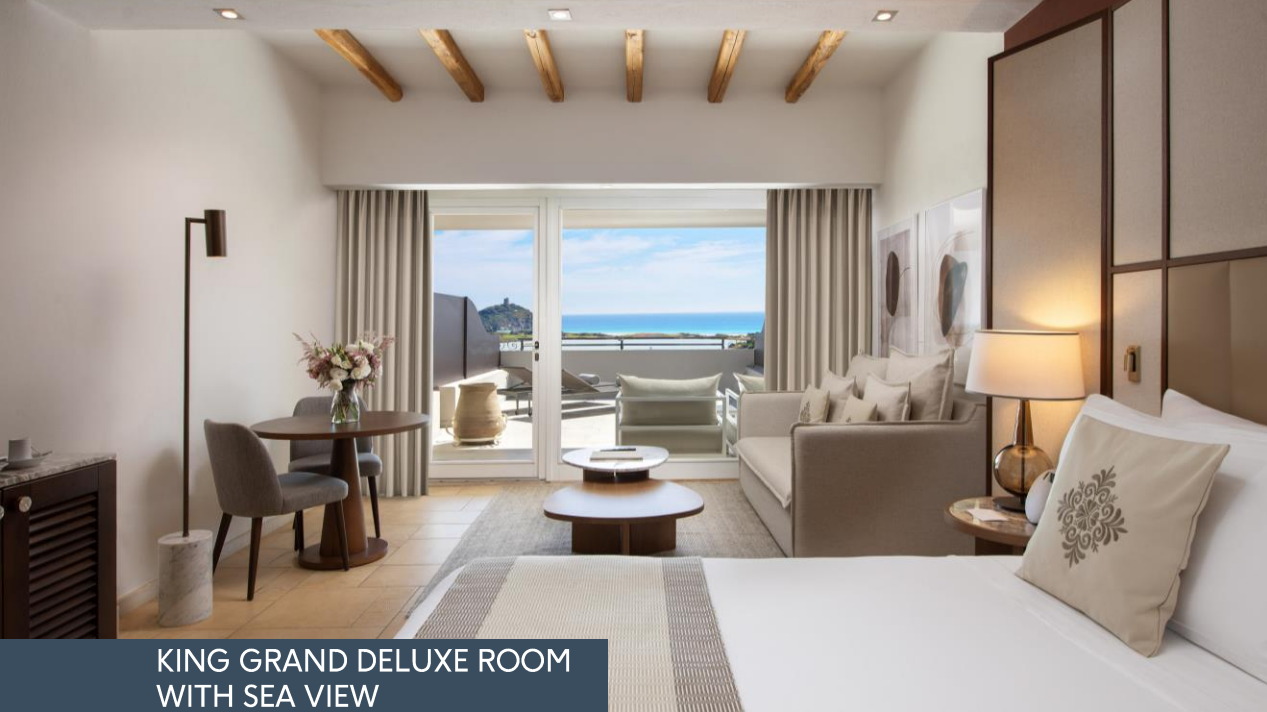
KING GRAND DELUXE ROOM WITH SEA VIEW