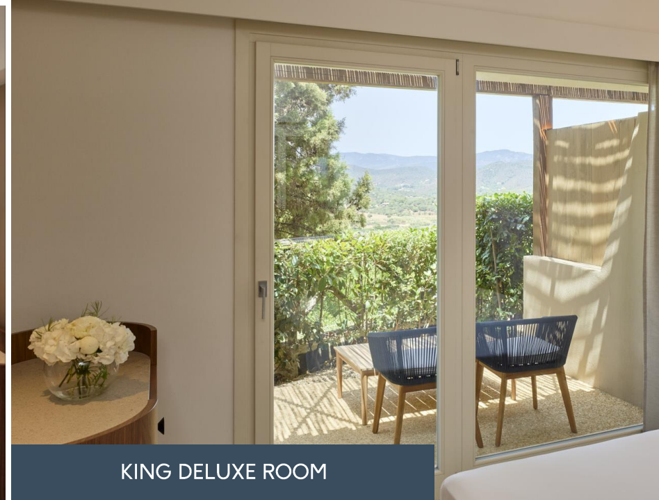
KING DELUXE ROOM