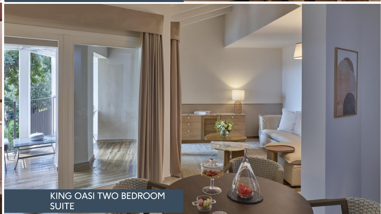
KING OASI TWO BEDROOM SUITE