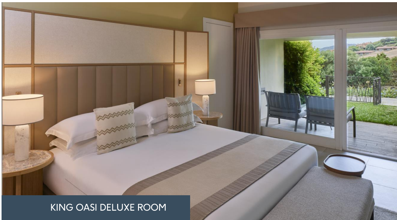
KING OASI DELUXE ROOM