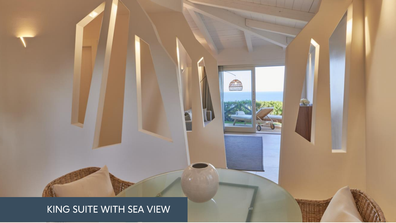
KING SUITE WITH SEA VIEW