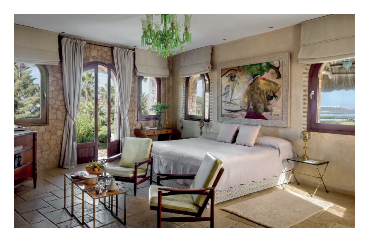
La Sultana Oualidia is an enchanting Moorish fortress surrounded by orange, olive and jacaranda trees, terraces, fountains and flowered balconies that overlook a serene lagoon on the Atlantic coast. A hidden gem by the ocean, La Sultana Oualidia has the ability to capture, energise and sooth in equal measure - the perfect antidote following a stay in the hustle and bustle of Marrakech.