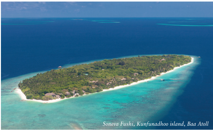
Soneva Fushi, Kunfunadhoo island, Baa Atoll