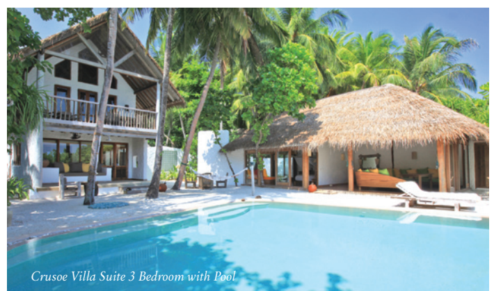
Crusoe Villa Suite 3 Bedroom with Pool