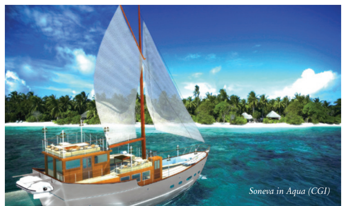
Soneva in Aqua (CGI)