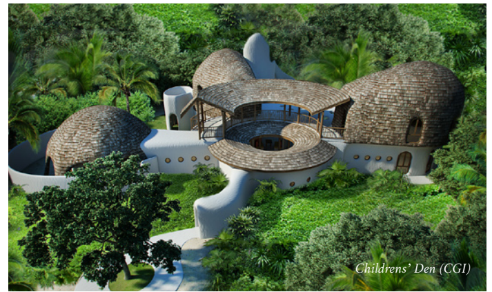
Childrens' Den (CGI)