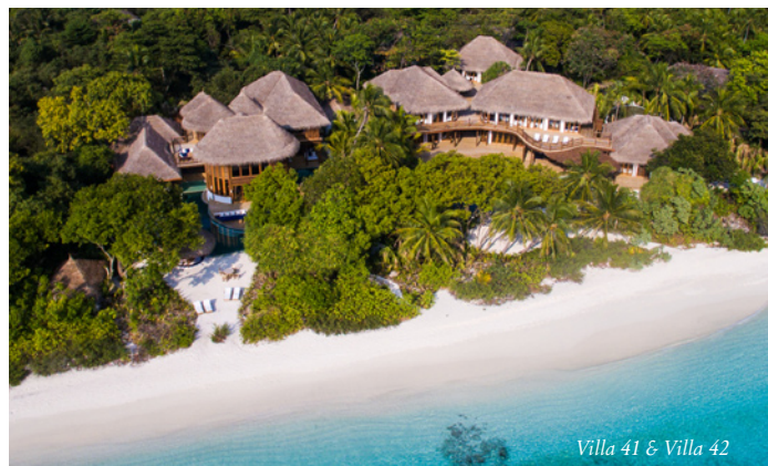
Villa 41 & Villa 42