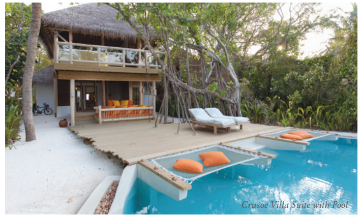
Crusoe Villa Suite with Pool