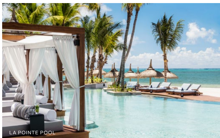
LA POINTE POOL