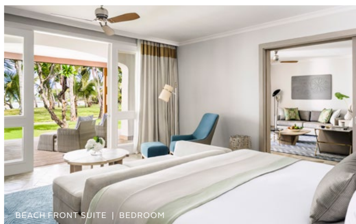
BEACH FRONT SUITE | BEDROOM