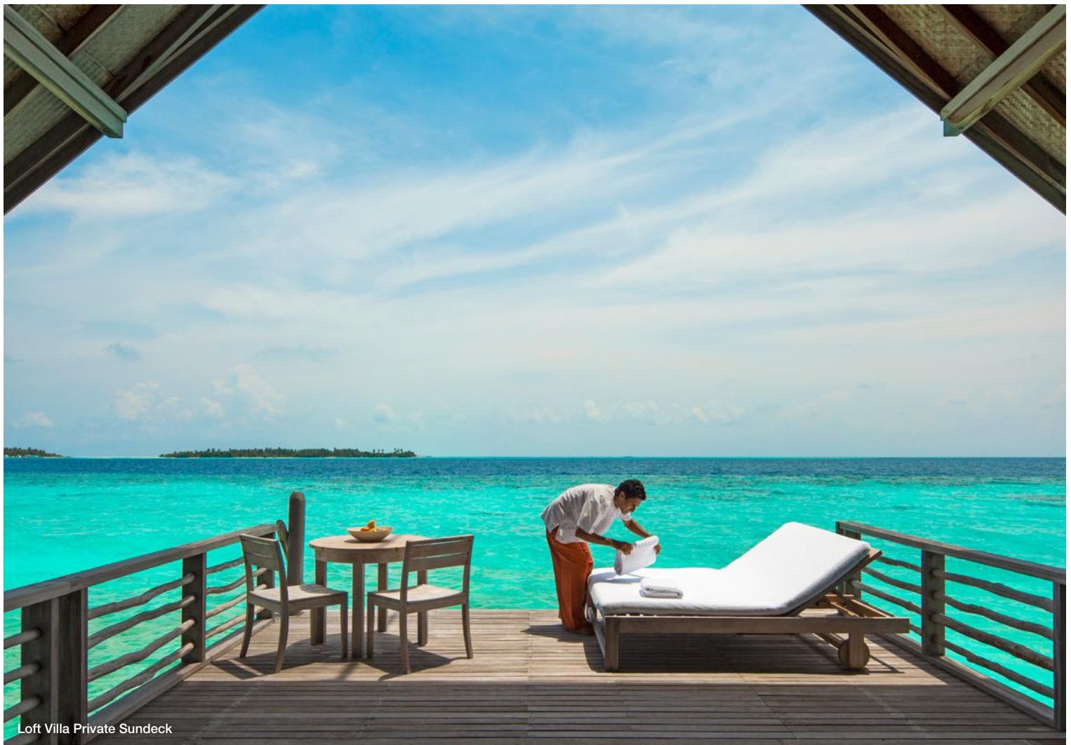
Loft Villa Private Sundeck