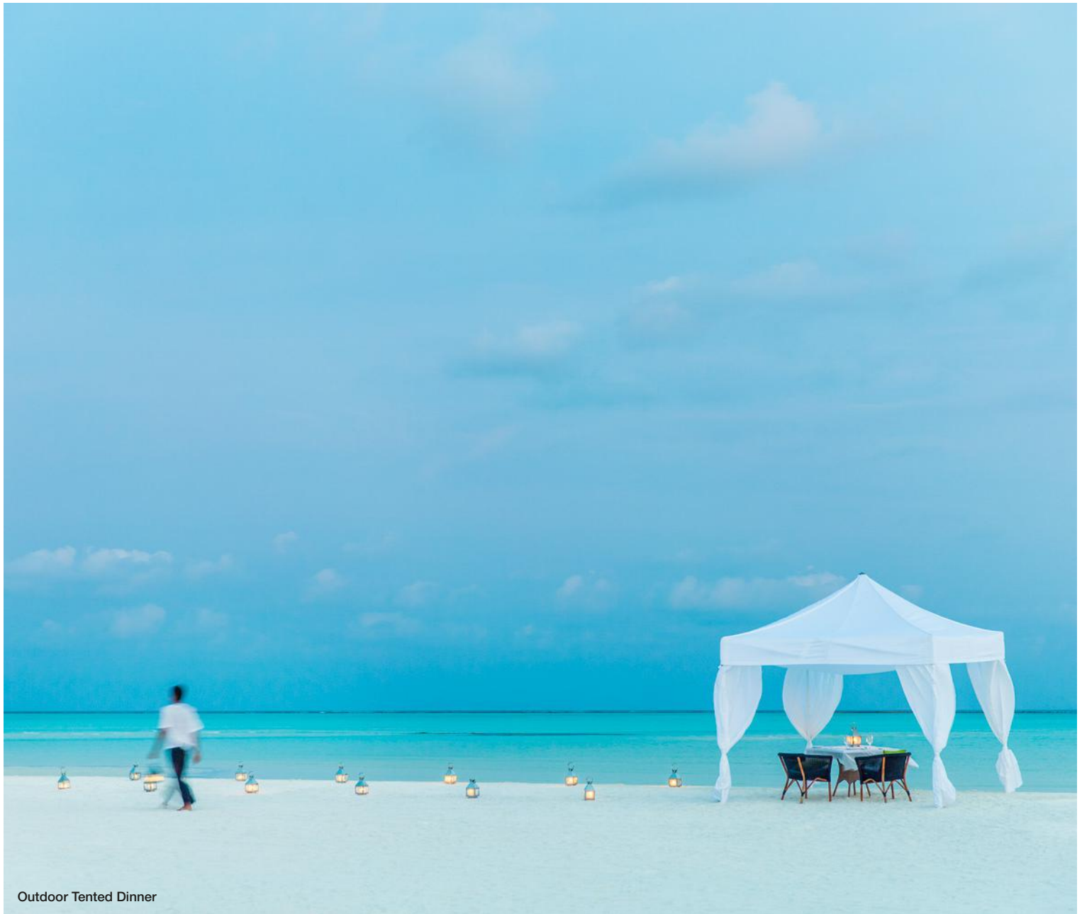
Outdoor Tented Dinner