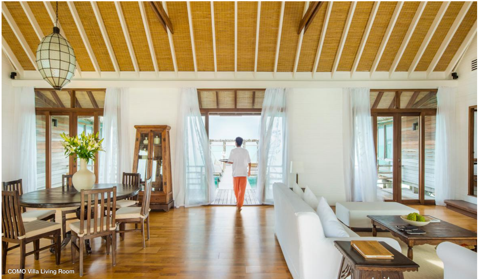
COMO Villa Living Room