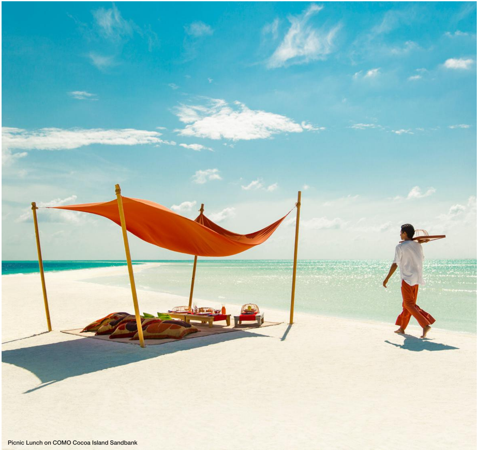
Picnic Lunch on COMO Cocoa Island Sandbank