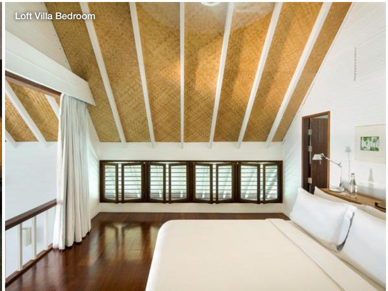
Loft Villa Bedroom