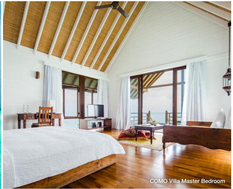
COMO Villa Master Bedroom