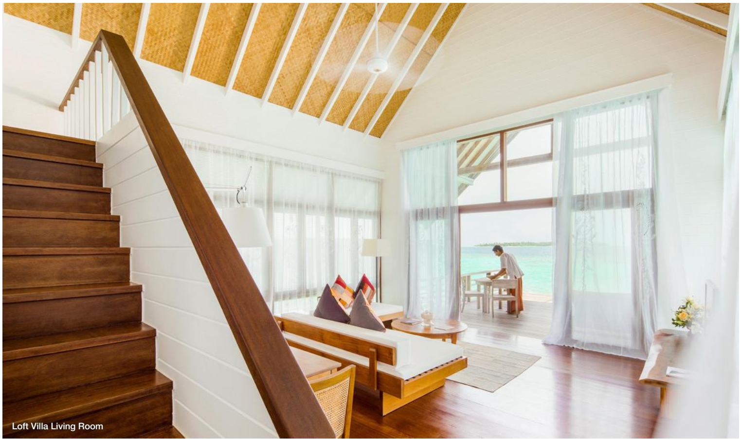
Loft Villa Living Room