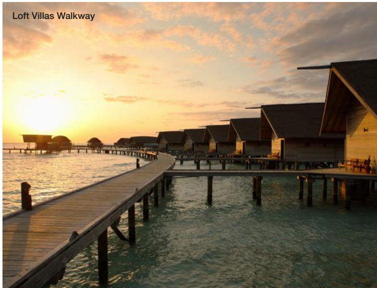
Loft Villas Walkway