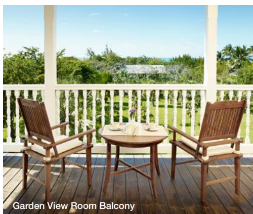
Garden View Room Balcony