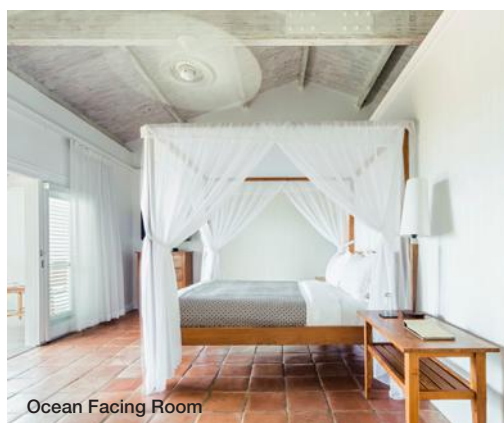
Ocean Facing Room