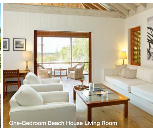
One-Bedroom Beach House Living Room