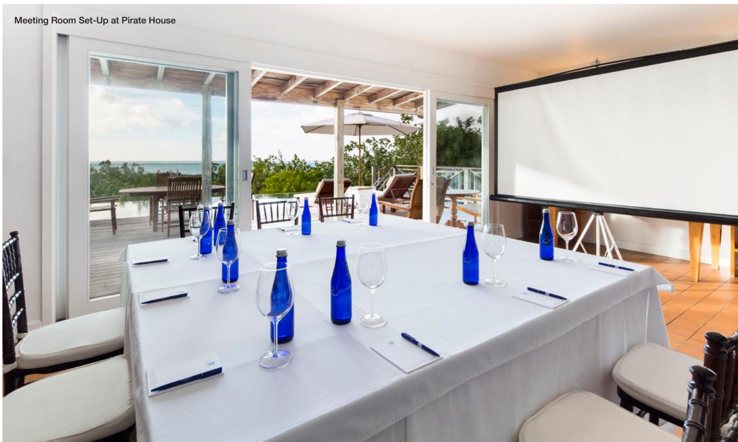
Meeting Room Set-Up at Pirate House

Our experienced team will be on hand to assist, ensuring every little detail is taken care of.