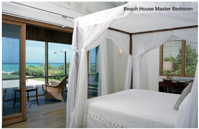
Beach House Master Bedroom