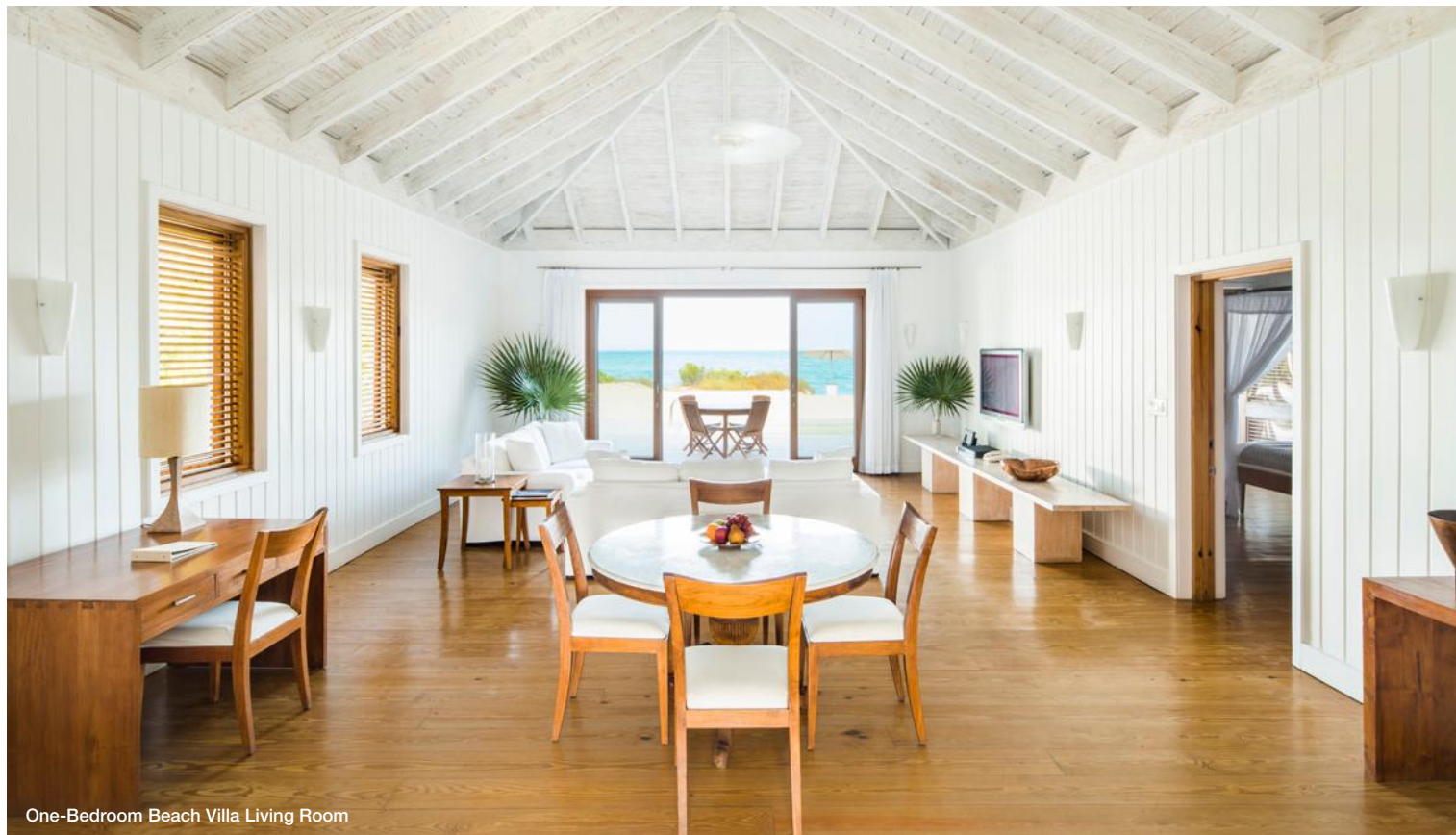
One-Bedroom Beach Villa Living Room