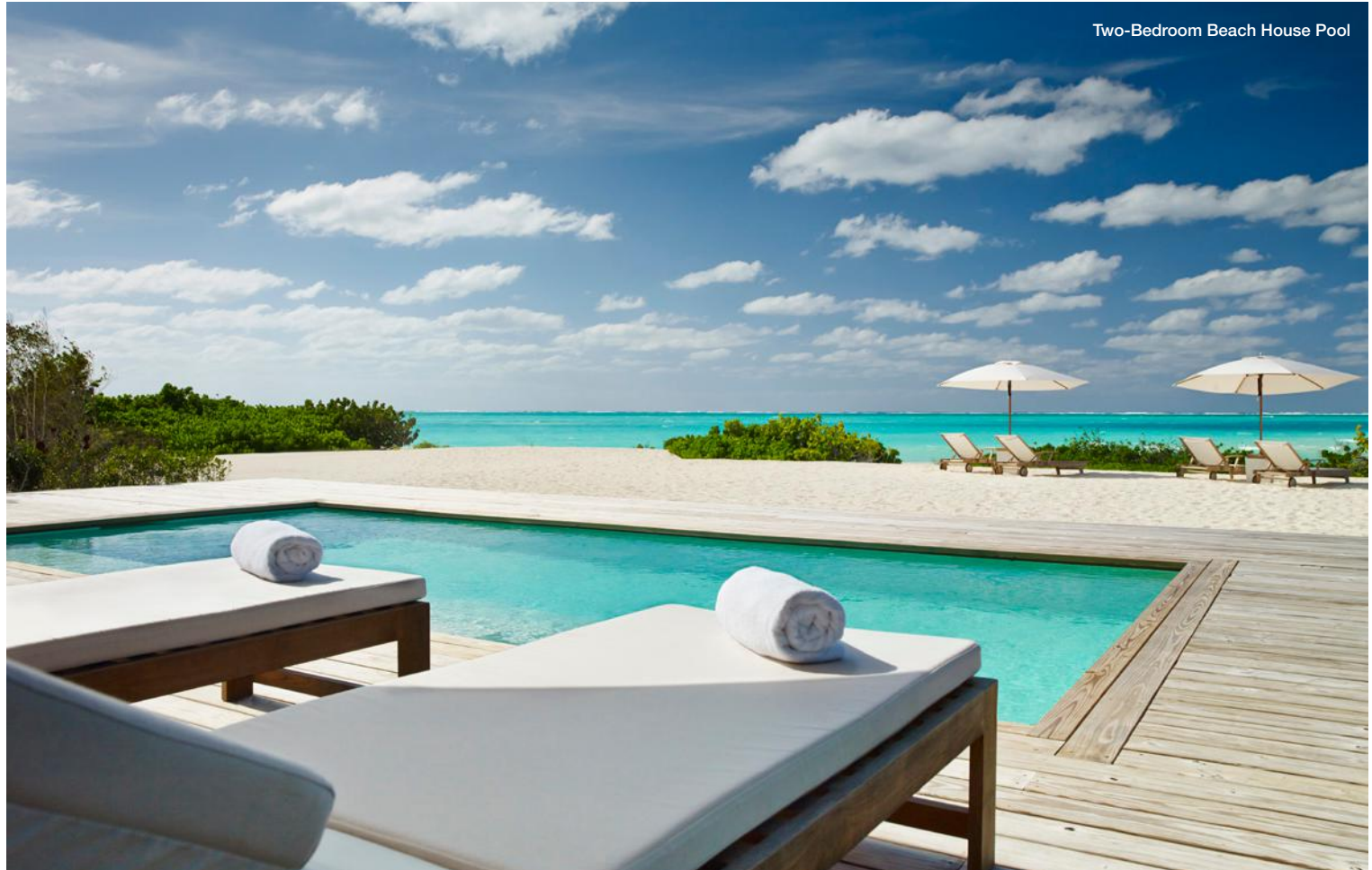
Two-Bedroom Beach House Pool