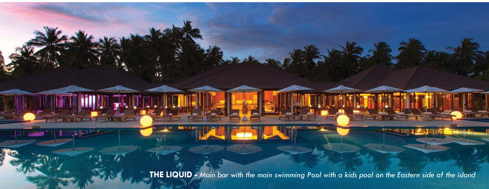
THE LIQUID - Main bar with the main swimming Pool with a kids pool on the Eastern side of the island