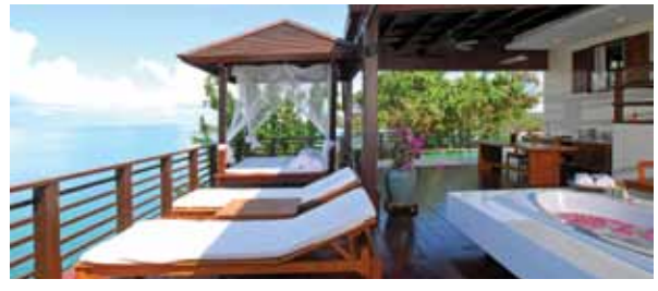
Akorn Villa (264 m<sup>2</sup>) Maximum occupancy: 4 adults or children

Akorn Villa: A 2-bedroom villa sharing an extensive open-air terrace (140 sq.m) boasting unobstructed sea view. Akorn Villa is largest of all guest rooms, accommodating up to 4 persons.