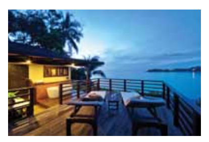
McGuigan Cottage (120 m<sup>2</sup>) Maximum occupancy: 3 adults or 2 adults+1 Maximum occupancy: 3 adults+1 child

This cottage is named after our "Papa and As its name suggests, this cottage is built. The biggest of all cottages at 160 sq.m.