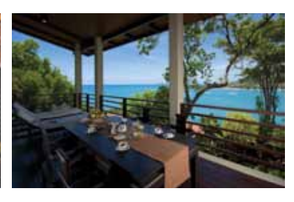
Viewpoint Family Cottage (160 \, \text{m}^2) Maximum occupancy: 5 adults or children

a large terrace and is very close to the vacy and glorious view. The large open-air most luxurious of all. terrace features a bathtub and gazebo.